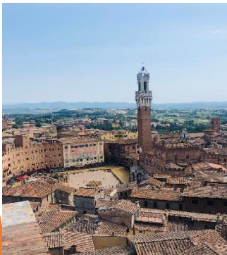
Piazza del Campo, Siena