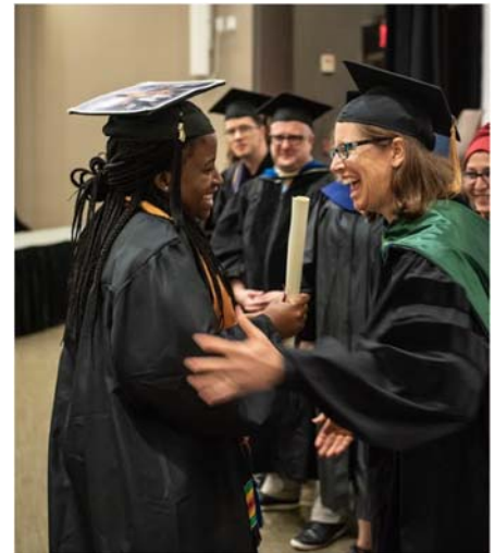
WGS Students receiving diplomas